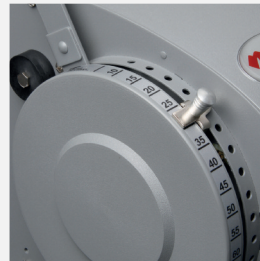
Fast Length Selection Quickly choose one of 15 preset tape lengths on clearly marked dial.