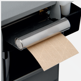
Superior Mechanics and Guillotine Blade Delivers clean, even cutting of reinforced and non-reinforced tape